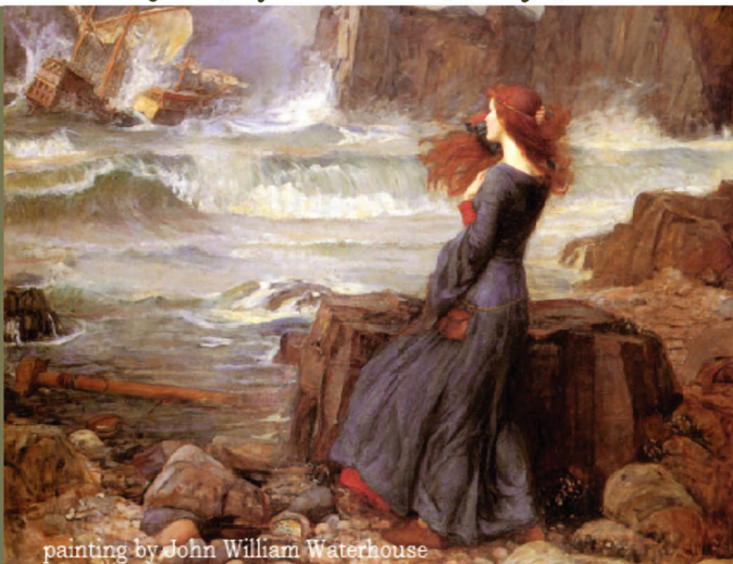
painting by John William Waterhouse